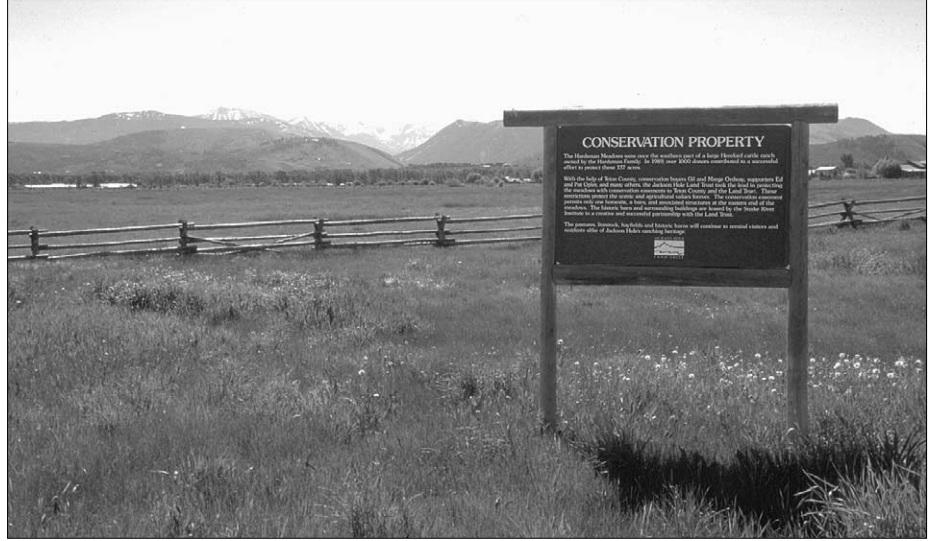
Conservation easements can protect land and scenic vistas. Jackson Hole, Wyoming.

• Many residents and local officials feel helpless in the face of rapid change. People know what they like about their communities and what they don’t like about new development. They just don’t know how they can preserve what they