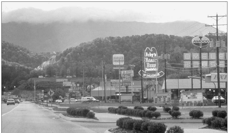
Is this what residents and visitors want to see? Outside Smoky Mountains National Park.