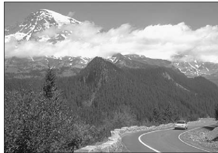
View of Mt. Rainer, WA

Traverse City, Michigan; Flagstaff, Arizona; Durango, Colorado; Talkeetna, Alaska; and Fredericksburg, Virginia are just a few of the many gateway communities trying to cope with rapid growth. It is not just retirees and telecommuters